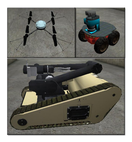
Fig. 1. Simulated pictures of the three robotic platforms used by the UC Merced team. The upper-left screenshot displays the AirRobot, the upper-right screenshot illustrates the P2AT, and the lower screenshot shows the Matilda. As can clearly be seen, the chosen robotic platforms are fervently diverse.

are stored inside a FIFO queue until a specific condition is met. Once the condition is satisfied, an operation checked by the Arbiter, the proper message handler is initiated. Based on the service architecture, an MSRS controller can be created by implementing a collection of services, each of which supplies the overall application with a specific task-related solution. Since MSRS will be used to both control the aerial robot and provide a user-friendly interface capable of generating valuable information for first-responders, the tasks incorporated in the controller, described in greater detail in Section 3, will include communication, grouping, victim placement, localization, etc... In addition, an orchestration service that interfaces with USARSim will be used (from last year's competition), since no such service is part of the MSRS distribution.